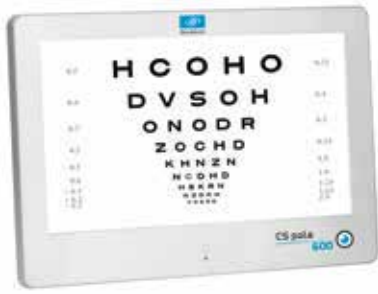
CS POLA 600